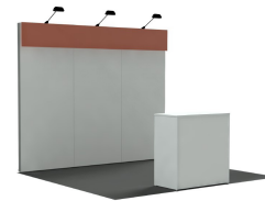
10x10 Hardwall Exhibit Package