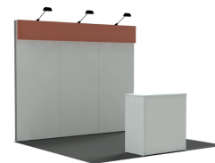
10x10 Hardwall Exhibit Package