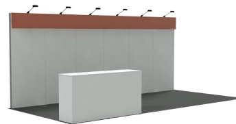
10x20 Hardwall Exhibit Package

*Gray carpet will be provided if color is not specified. Blue or black carpet may be substituted at no additional costs. Please note there are no substitutions to the packages.