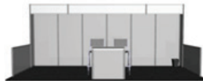
10x20 Hardwall Exhibit Package

*Gray carpet will be provided if color is not specified. Blue or black carpet may be substituted at no additional costs. Please note there are no substitutions to the packages.