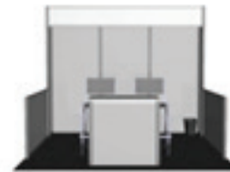
10x10 Hardwall Exhibit Package